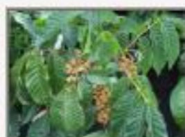
Tri_mar9100099.JPG Trichilia martiana (?), Meliaceae. Temash River