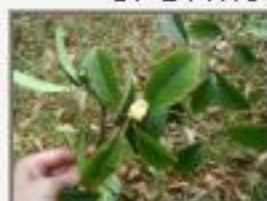
Clu_5030007.JPG Clusia sp. Clusiaceae. Conejo Creek, Toledo.