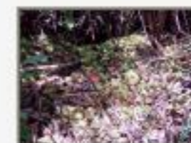
Sph_8260075.JPG Sphagnum bog approach near Sarstoon River.