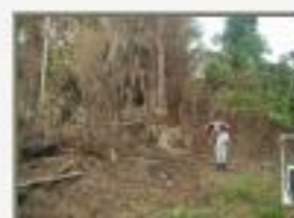
Boundary5280028.JPG Northern Boundary (With Midway) of Sarstoon