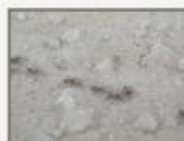
Brach5040068.JPG Brachypelma?? Procession of baby