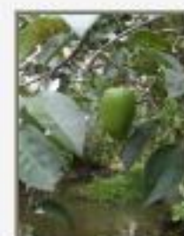
Ano_gla5070022.JPG Anona glabra. Anonaceae. BFREE,