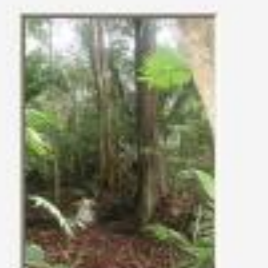
Karst5290104.JPG Forest at base of karst hill. Midway, Toledo