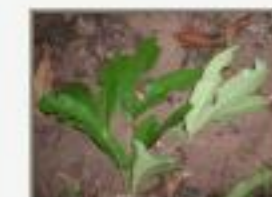
For_tri5280041.JPG Forchhammeria trifoliata. Capparidaceae. Midway,