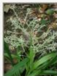
Dra_ame5050095.JPG Dracaena americana Dracaenaceae. Sunday