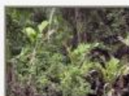
Man_sac8260058.JPG Manicaria saccifera. Sarstoon River.