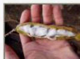
Ing_ver9100025.JPG Inga vera. Mimosoideae. Temash near Crique