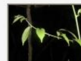
Cel_5290091.JPG Celtis sp. Ulmaceae. Midway, Toledo