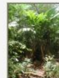
Man_sac5200019.JPG Manicaria saccifera. Arecaceae. Temash