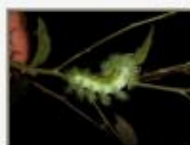
utom_9100040b.JPG Automeris CP on