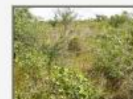
Spha_8260096.JPG Sphagnum bog approach near Black Creek