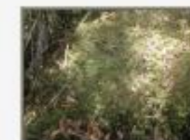
Sph_sub5220091.JPG Sphagnum subsecundum var.