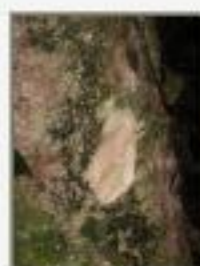
Cra_tap5280039.JPG Crateva tapia?, Capparaceae?. Large