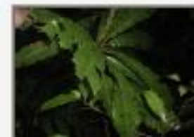
Pou_5280044.JPG Pouteria sp. Sapotaceae. Base of limestone hill,