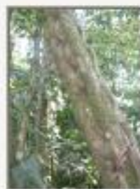
Bau_gui5050106.JPG Bauhinia guianensis, Caesalpinoideae.