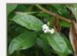
Rubiaceae5280024.JPG Rubiaceae. Midway, Toledo