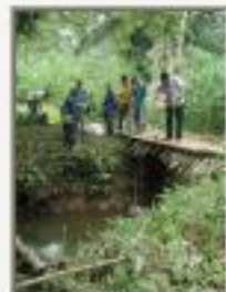
P5030002.JPG "Branch" at Conejo Creek, Toledo