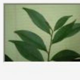
P5040060.JPG To'loch, Watery sap. Conejo Creek, Toledo