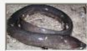
Oph_aen.jpg Ophisternon aenigmaticum,