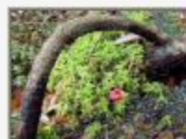
Spha_8260028.JPG Sphagnum bog approach near Sarstoon River.