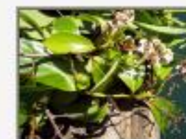
Ocot_9100009.JPG Ocotea? sp. Lauraceae. Temash River, nr. Crique