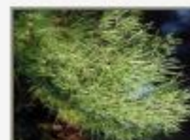
Gua_lon9100039.JPG Guadua longifolia. Poaceae. Crique Sarco