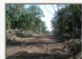
Road5270002.JPG New agricultural road (lease-subdivision) near