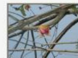
Ann_5050110.JPG Annona sp. Annonaceae. Sunday