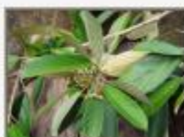
Cou_oli9100075.JPG Coussapoa oligocephala. Cecropiaceae. Temash