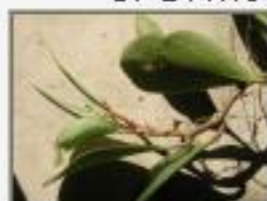
Perom4230010.JPG Peperomia, Piperaceae. Barranco, Toledo district.