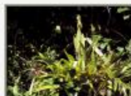
Aec_til9100036.JPG Aechmea tillandsioides. Bromeliaceae. Temash at