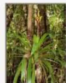
Guz_sch8260086.JPG Guzmania scherzeriana. Bromeliaceae. Sarstoon,