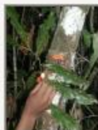
Com_spr_5030005.JPG Compsonera sprucei . Myristicaceae. Conejo