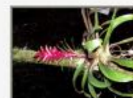
Vri_hel9090023.JPG Vriesea heliconioides. Bromeliaceae. Crique