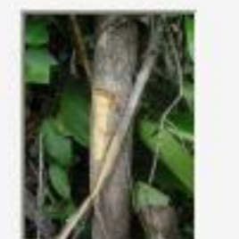
Swe_pan5280023.JPG Sweetenia panamensis. Papilionideae. Midway,