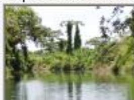
Scrub9100085.JPG Disturbed riparian scrub along Temash near