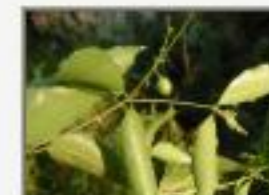
Rin_5050072.JPG Rinorea sp. Violaceae. Conejo Creek, Toledo