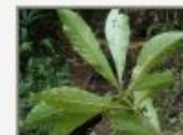
Als_hon5050080.JPG Alseis hondurensis? Rubiaceae. Sunday