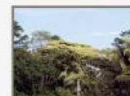
P8260030.JPG Flowering tree on Guatemalan side