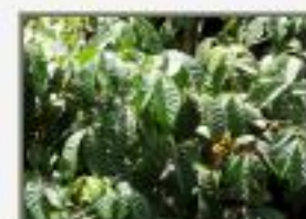
Tri_mar9100096.JPG Trichilia martiana (?), Meliaceae. Temash River