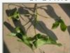
Mon_arb4230024.JPG Montrichardia arborescens, araceae.