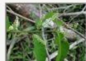
Com_lax5050107.JPG Combretum laxum? Combretaceae?, Sunday