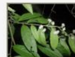
Dic_don5280007.JPG Dichapetalum donnell-smithii var.