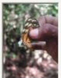
he_ang5280061.JPG Chetone angulosa.