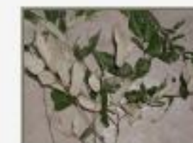
Lic_hyp4240019.JPG Lycania hypoleuca. Chrysobalanaceae.