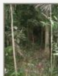
Transect5280017.JPG Vegetation Transect in high forest near Midway,