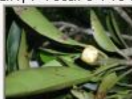
Clu_5190005.JPG Clusia sp.?? Clusiaceae. Sarstoon River. Toledo