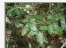
Con_lam5220111.JPG Connarus lamberti. Connaraceae.