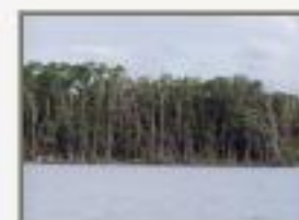
Bar_shore8260050.JPG Mangrove shore south of Barranco