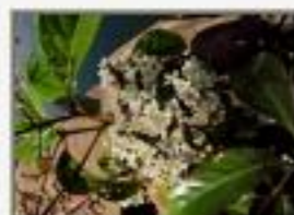
Ocot_9100011.JPG Ocotea? sp. Lauraceae. Temash River, nr. Crique