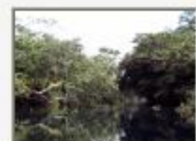
Temash9100065.JPG Temash River nr. Crique Sarco