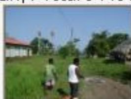
Barr4160021.JPG Barranco, Toledo district. 441,533