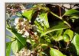
Ocot_9100010.JPG Ocotea? sp. Lauraceae. Temash River, nr. Crique