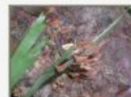
Sch_poe5220068.JPG Schizaea poeppigiana. Schizaeaceae. Sarstoon