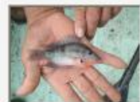
Cic_mee5010026.JPG Cichlasoma meeki,