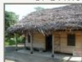
Barr4160020.JPG Barranco, Toledo district. 445,705