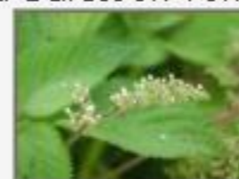
Lap_aes4250015.JPG Laportea aestuans, Urticaceae. Barranco