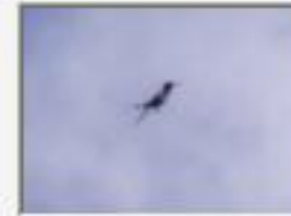
NJacobin9100064.J White necked