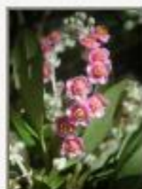
Sch_bel5220096.JPG Schizocardia belizensis. Clethraceae. Sphagnum