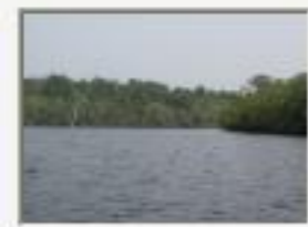
P5030013.JPG Temash lagoon near Conejo Creek, Toledo