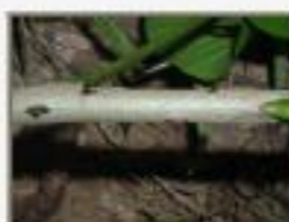
Zan_5050101.JPG Zanthoxylum sp. Rutaceae. Sunday