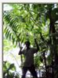
Zam_var8260007.JPG Zamia variegata. Sarstoon River, Belize