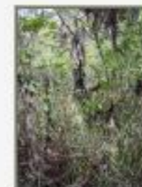
Spha_8260072.JPG Sphagnum bog habitat near Sarstoon River.