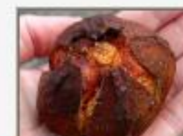
Car_gui_fr.JPG Carapa guianensis. Meliaceae. Sarstoon,