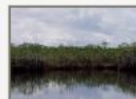
Bla_cre8260078.JPG Black Creek, Toledo district.