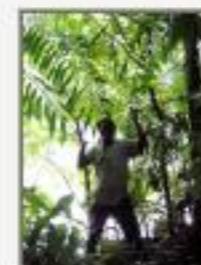
Zam_var8260009.JPG Zamia variegata. Sarstoon River, Belize