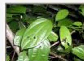
Abu_pan.jpg Abuta panamensis. Menispermaceae.