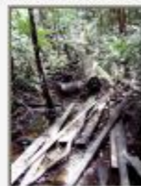
Logging_8260064.JPG Loggin (Santa Maria) along Sarstoon River