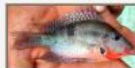
Cic_mee.jpg Cichlasoma meeki, Cichlidae. Spanish