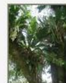
Ant_Sch4160011.JPG Anthurium nr. schlechtendalii. Crique