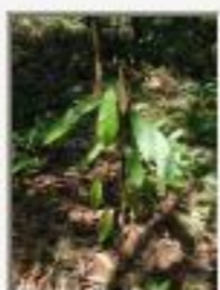
The_cac4160018.JPG Theobroma cacao plantation from Greg