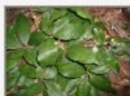
Vit_kuy5030022.JPG Vitex kuylenii, Verbenaceae. Conejo