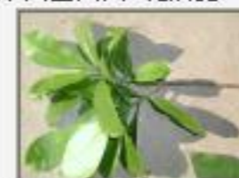
The_aho4230017.JPG Thevetia ahouai. Apocynaceae.