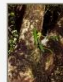
Pol_cla8260066.JPG Polystachya clavata. Orchidaceae, Sarstoon