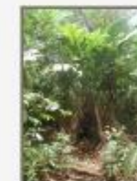
Man_sac5200020.JPG Manicaria saccifera. Arecaceae. Temash