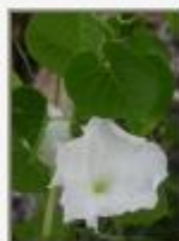
lpo_alb4250006.JPG Ipomoea alba. Convolvulaceae.