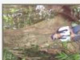
Ste_mex9090005.JPG Sterculia mexicana. Sterculiaceae. Bole. With