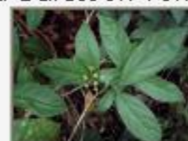
Den_arb8260012.JPG Dendropanax arboreus. Araliaceae. Crique Sarco