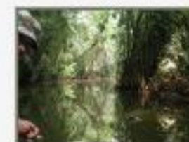
P5030012.JPG Conejo Creek (downstream at