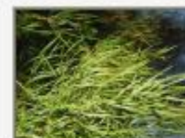
Gua_lon9100040.JPG Guadua longifolia. Poaceae. Crique Sarco