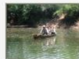
Sarstoon4160005.JPG Temash at Crique Sarco, Toledo District, Belize. In