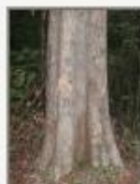
Dal_ste5280018.JPG Dalbergia stevensoni. Papilionoideae. Midway,