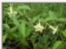
Odont5290098.JPG Odontadenia ? Apocynaceae. Midway