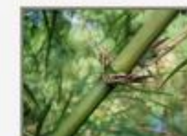
Gua_lon9100051.JPG Guadua longifolia. Poaceae. Crique Sarco