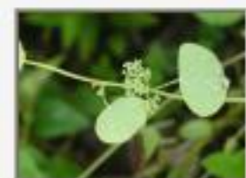
Cis_par5290099.JPG Cissampelos pareira. Menispermaceae.