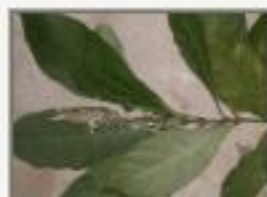
Ode_alb4240026.JPG Odontonema albiflorum. Acanthaceae. Barranco.