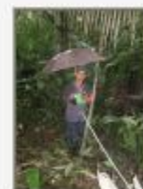
Transect5280034.JPG Vegetation Transect in hill base forest near