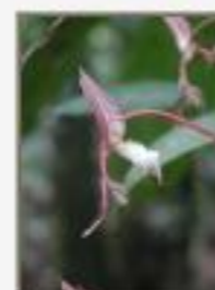
Gon_qui5280063.JPG Gongora quinquenervis. Orchidaeeae. Midway,