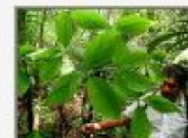
Cou_mac.JPG Couma macrocarpa. Apocynaceae. Temash,