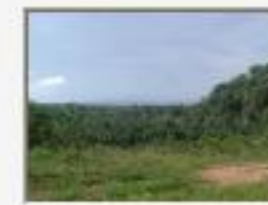
P5280049.JPG View from karst hill in northern Sarstoon