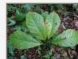
Coc_5280047.JPG Coccoloba sp. Polygonaceae. Midway,