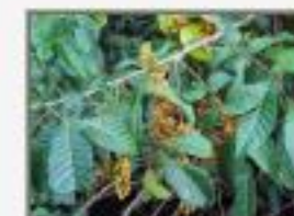
Tri_mar9100014.JPG Trichilia martiana (?), Meliaceae. Temash River