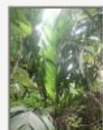
Man_sac5200021.JPG Manicaria saccifera. Arecaceae. Temash