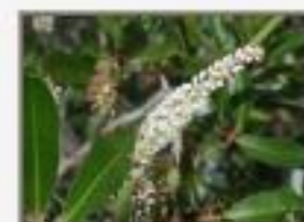
Cyr_rac5220115.JPG Cyrilla racemiflora. Cyrillaceae. Sphagnum