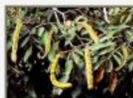
Ing_ver.JPG Inga vera. Mimosoideae. Temash near Crique