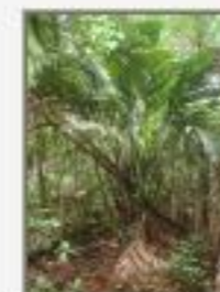
Man_sac5200018.JPG Manicaria saccifera. Arecaceae. Temash