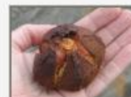
Car_gui5200034.JPG Carapa guianensis. Meliaceae. Sarstoon,