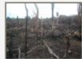
Milpa5280012.JPG New agricultural road (lease-subdivision) near