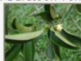
Clu_5190006.JPG Clusia sp.?? Clusiaceae. Sarstoon River. Toledo