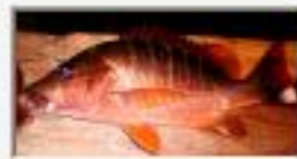
Lut_joc.jpg Lutjanus jocu. Lutjanidae: Dog