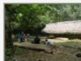
P5030009.JPG Conejo Creek (downstream at