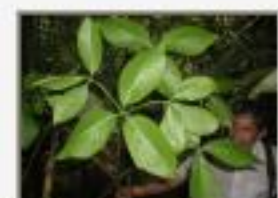
Cou_mac5220082.JPG Couma macrocarpa. Apocynaceae. Temash,