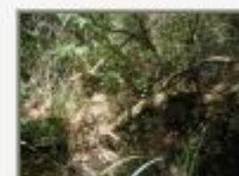
P5220108.JPG Sphagnum swamp in Sarstoon Temash NP