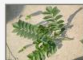
Spo_pur4230018.JPG Spondias purpurea. Anacardiaceae.