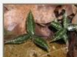
P5280036.JPG Unknown, tiny herb. Base of limestone hill,