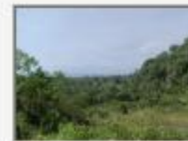
P5280059.JPG View from karst hill in northern Sarstoon