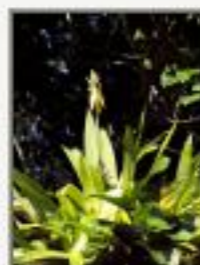
Aec_til9100038.JPG Aechmea tillandsioides. Bromeliaceae. Temash at