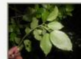
Hyp_5290093.JPG Hyperbaena ? Menispermaceae ?.