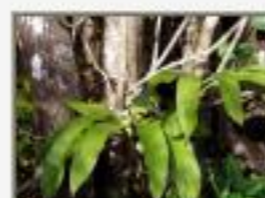
Cat_ege8260029.JPG Catasetum egertonianum.