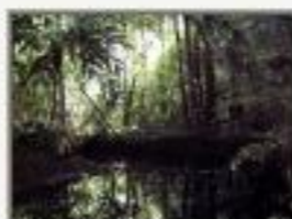
Swampf_CS9090034.JPG Swampforest nr. Crique