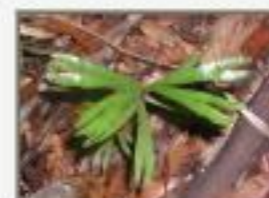
Sch_poe5220066.JPG Schizaea poeppigiana. Schizaeaceae. Temash