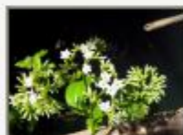
Tour_9100092.JPG Tournefortia (bicolor?), Boraginaceae. Temash