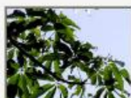
Ste_mex.JPG Sterculia mexicana. Sterculiaceae.