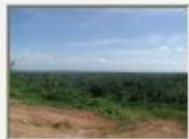
P5280052.JPG View from karst hill in northern Sarstoon