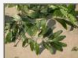
Car_gui4230021.JPG Carapa guianensis. Meliaceae. Barranco,