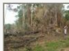
Boundary5280030.JPG Northern Boundary (With Midway) of Sarstoon