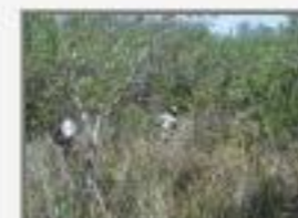
P5220100.JPG Sphagnum swamp in Sarstoon Temash NP