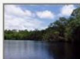
Bla_cre8260079.JPG Black Creek, Toledo district.