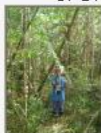
Zam_var5030016.JPG Zamia variegata, Zamiaceae. Temash