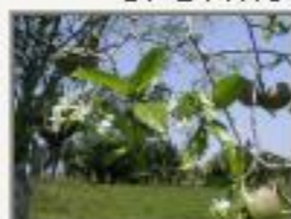
Tab_arb4160015.JPG Tabernaemontana arborea. Apocynaceae.