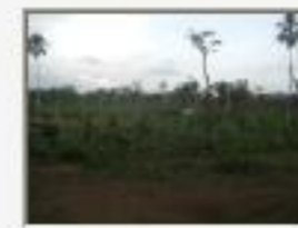
Milpa5280010.JPG New agricultural road (lease-subdivision) near