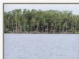
Bar_shore8260051.JPG Mangrove shore south of Barranco