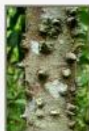
Lac_sta_tr.JPG Lacmellea standleyi. Apocynaceae. Conejo