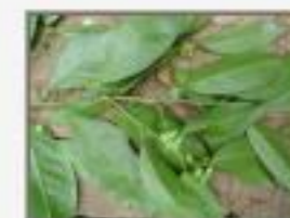
Hei_med5050083.JPG Heisteria media. Olacaceae. Sunday