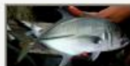
Car_lat.jpg Caranx latus. Carangidae.