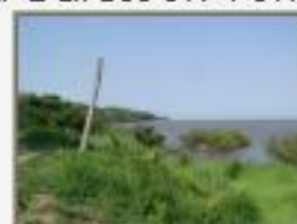
Barr4160022.JPG Barranco, Toledo district. 420,267