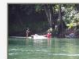
Criq_sar9100063.JPG Temash at Crique Sarco. 631,534