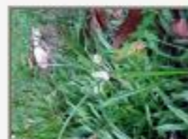
Oxy_cub9100044.JPG Oxycaryum (Scirpus) cubense. Crique Sarco