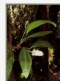
Ant_sca8260092.JPG Anthurium nr. scandens. Crique Sarco, Toledo