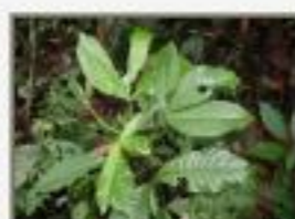
Cra_tap5290101.JPG Crateva tapia?, Capparaceae?. Large