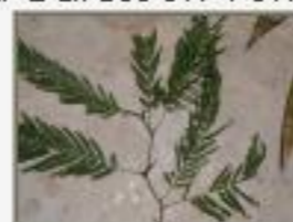
Acacia4240015.JPG Acacia sp. Mimosoideae. Barranco, Toledo