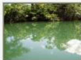
Der_maw9100012.JPG Dermatemys mawii,