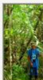
Zam_var_plnt.jpg Zamia variegata, Zamiaceae. Temash