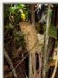
Zam_var8260006.JPG Zamia variegata. Sarstoon River, Belize