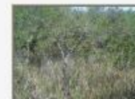
P5220101.JPG Sphagnum swamp in Sarstoon Temash NP