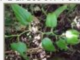
Smi_reg9100008.JPG Smilax regelii, Smilacaceae. Temash