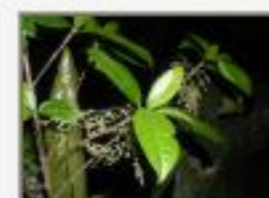
P5280088.JPG Unknown shrub/tree on karst hill. Midway, Toledo