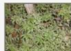
Sph_sub5220092.JPG Sphagnum subsecundum var.