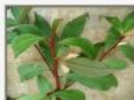
Par_ses5050092.JPG Parathesis sessiliflora? Myrsinaceae. Sunday