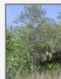
P5220114.JPG Sphagnum swamp in Sarstoon Temash NP