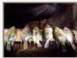
Cic_9100002.JPG Cichlasoma maculicauda (?).