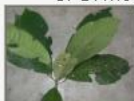
Slo_tue4240020.JPG Sloanea tuerckheimii. Eleocarpaceae.