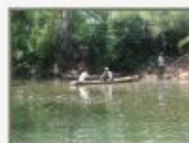
Sarstoon4160004.JPG Temash at Crique Sarco, Toledo District, Belize. In