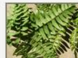
Fern4230011.JPG Fern, Barranco, Toledo 455,097