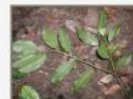
Hei_med5040061.JPG Heisteria media, Olacaceae. Conejo