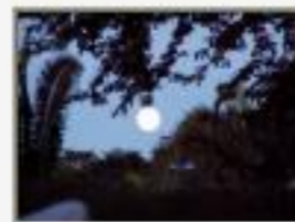
Moon9090038.JPG Moon over Crique Sarco 619,694