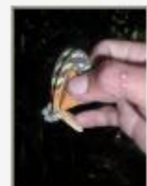
he_ang5280060.JPG Chetone angulosa.