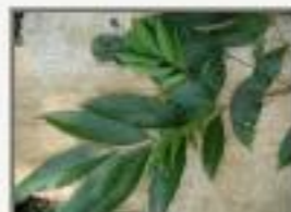
Pro_mul5050094.JPG Protium multiramiflorum? Burseraceae. Sunday