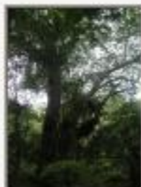
Pseudob5280089.JPG Pseudobombax sp. Bombacaceae. Midway,