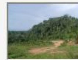
P5280050.JPG View from karst hill in northern Sarstoon