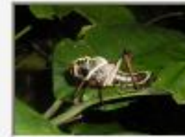
P5290108.JPG Midway, Toledo. 395,283