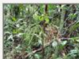
Geo_dev9090026.JPG Geonoma deversa. Arecaceae. nr. Crique