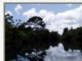
Scrub9100090.JPG Disturbed riparian scrub along Temash near