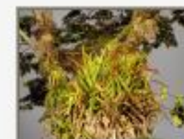
Aec_bra9110042.JPG Aechmea bracteata. Bromeliaceae. Crique