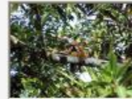
Trogon9100058.JPG Trogon, Crique