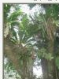
Anth4160012.JPG Anthurium sp. Crique Sarco, Toledo District,