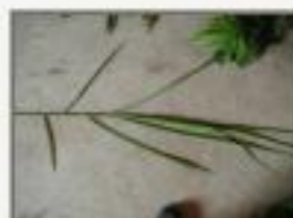
dumbcane4230006.JPG Dumbcane, Wildcane, Maburu = Tripsacum.