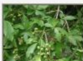
Vit_kuy5070013.JPG Vitex kuylenii. Verbenaceae. BFREE,