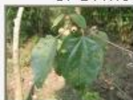
Ham_5050108.JPG Hampea? Sunday Wood, Toledo.