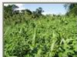
Scrub9100030.JPG Disturbed riparian scrub along Temash near