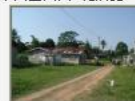
Barr4160023.JPG Barranco, Toledo district. 425,292