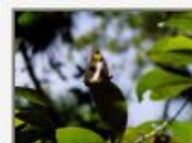
ade_bas8260081.JPG Adelpha basiloides.