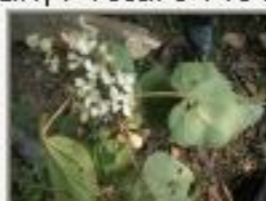
Ham_5050109.JPG Hampea? Sunday Wood, Toledo.