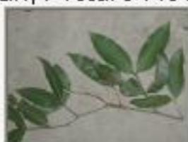
Mou_exi4240023.JPG Mouriri exilis. Melastomatacea.