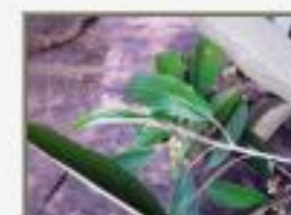
Cou_oli9100078.JPG Coussapoa oligocephala. Cecropiaceae. Temash