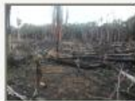
Milpa5280013.JPG New agricultural road (lease-subdivision) near