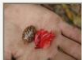
Com_spr5030006.JPG Compsonera sprucei. Myristicaceae. Conejo