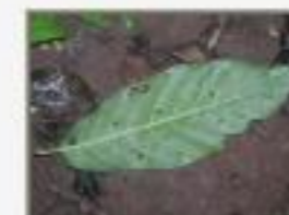
Flac_5280043.JPG Flacourtiaceae??, Base of limestone hill. Midway,