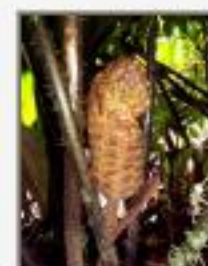
Zam_var_frt.JPG Zamia variegata. Sarstoon River, Belize