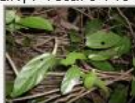
Abu_pan5270006.JPG Abuta panamensis. Menispermaceae.