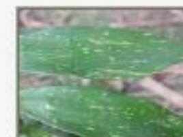
Zam_var5050075.JPG Zamia variegata. Conejo Creek, Toledo.