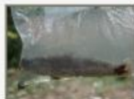
ero_sma5040065.JPG Erotelis smaragdus.