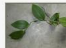
Van_har4240001.JPG Vanilla hartii?? Orchidaceae. Barranco,