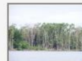
Barr_shore8260049.JPG Mangrove shore south of Barranco