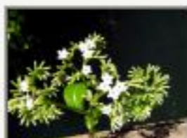
Tour_9100093.JPG Tournefortia (bicolor?), Boraginaceae. Temash