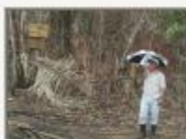
Boundary5280029.JPG Northern Boundary (With Midway) of Sarstoon