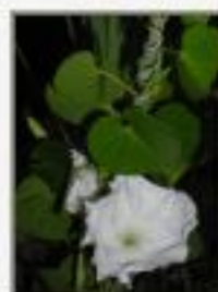
lpo_alb4250005.JPG Ipomoea alba. Convolvulaceae.