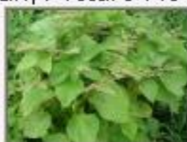
Lap_aes4250014.JPG Laportea aestuans, Urticaceae. Barranco