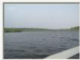
P5030014.JPG Temash lagoon near Conejo Creek, Toledo