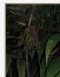
Geo_5050086.JPG Geonoma sp. Arecaceae. Sunday