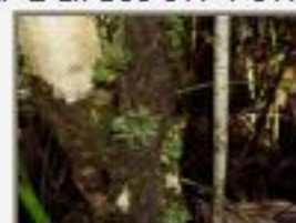
Pleur_260068.JPG Pleurothallus sp. Orchidaceae, Sarstoon