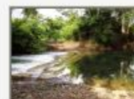
Criq_Sar9110045.JPG Crique sarco: road crossing