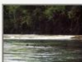
Criq_sar9110043.JPG Crique sarco: road crossing