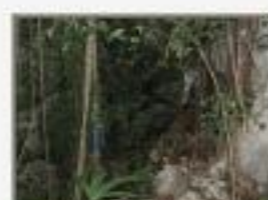
Karst5280085.JPG Karst hill near Midway, Toledo