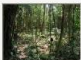
The_cac4160016.JPG Theobroma cacao plantation from Greg