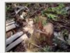
LoggingP8260020.JPG Logging (Santa Maria) along Sarstoon River