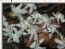
Tab_arb4240005.JPG Tabernaemontana arborea. Apocynaceae.