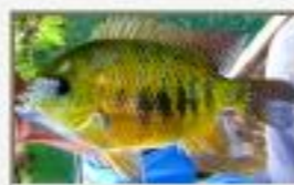
Cic_boc.jpg Cichlasoma bocourti. Cichlidae.