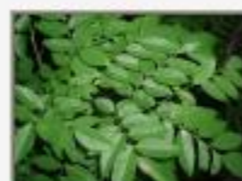
Swe_pan5280021.JPG Sweetenia panamensis. Papilionideae. Midway,