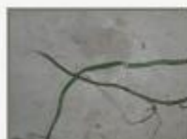
Cact4240028.JPG Cactaceae: Selenicereus? Barranco,