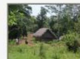
Cric_sar4160009.JPG Crique Sarco, Toledo 473,587