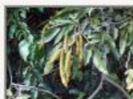
Ing_ver9100021.JPG Inga vera. Mimosoideae. Temash near Crique