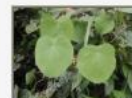
Cis_par5290090.JPG Cissampelos pareira. Menispermaceae.