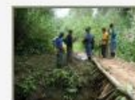
P5030001.JPG "Branch" at Conejo Creek, Toledo