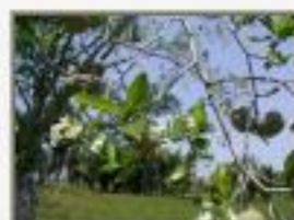
Tab_arb4160014.JPG Tabernaemontana arborea. Apocynaceae.