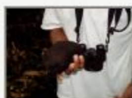
Ste_mex9090004.JPG Sterculia mexicana. Sterculiaceae. Fruit.