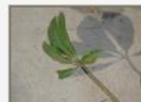
Pac_aqu4230023.JPG Pachyra aquatica. Bombacaceae.