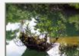
Lin_riv9100028.JPG Lindenia rivalis. Rubiaceae. Temash nr