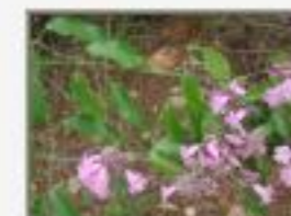
Bign5290114.JPG Bignoniaceae vine. Forest Home, Toledo