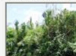
Scrub9100095.JPG Disturbed riparian scrub along Temash near