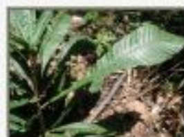
Gri_cau5040053.JPG Grias cauliflora, Lecythidaceae. Conejo