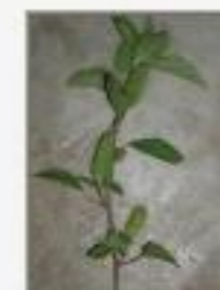
Acalypha4250017.JPG Acalypha sp. Euphorbiaceae.