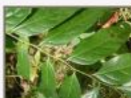
Cas_syl5050103.JPG Casearia (sylvestris?) Flacourtiaceae. Sunday