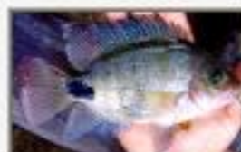
Cic_mac.jpg Cichlasoma maculicauda (?).