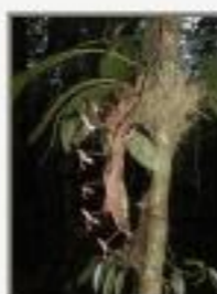
Gon_qui5280062.JPG Gongora quinquenervis. Orchidaeeae. Midway,