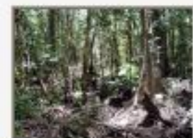
Swampf_CS9090029.JPG Swampforest nr. Crique