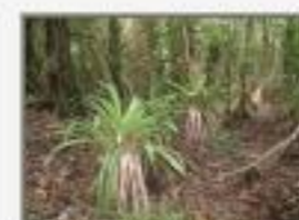
Vri_gla5220116.JPG Vriesea gladioliflora, Bromeliaceae.