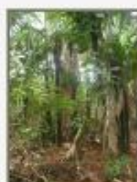
Man_sac5200022.JPG Manicaria saccifera. Arecaceae. Temash