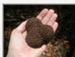
Man_sac5200023.JPG Manicaria saccifera. Arecaceae. Temash