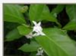
Rubiaceae5280024.JPG Rubiaceae. Midway, Toledo