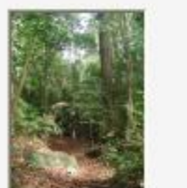
Karst5290102.JPG Forest at base of karst hill. Midway, Toledo