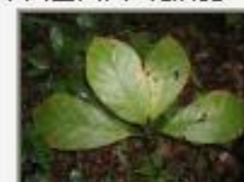
Coc_5280046.JPG Coccoloba sp. Polygonaceae. Midway,