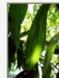
Zam_var8260011.JPG Zamia variegata. Sarstoon River, Belize