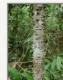
Lac_sta5030004.JPG Lacmellea standleyi. Apocynaceae. Conejo