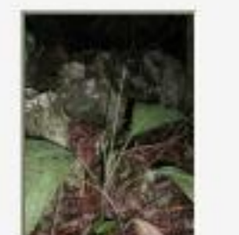
Xate5280081.JPG Xate: Chamaeodorea ernesti-augusti. Cut for