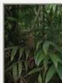
Geo_5050087.JPG Geonoma sp. Arecaceae. Sunday