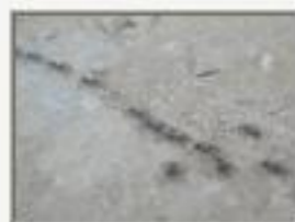
Brach5040070.JPG Brachypelma?? Procession of baby