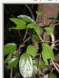
Abu_pan5270005.JPG Abuta panamensis. Menispermaceae.