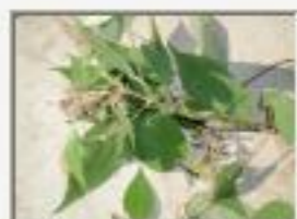
Clidemia4230016.JPG Clidemia (sericea, hirta?),