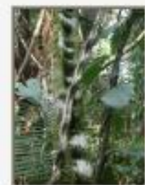
Bau_gui5050105.JPG Bauhinia guianensis, Caesalpinoideae.