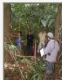
Transect5270003.JPG Vegetation transect, Midway, Toledo