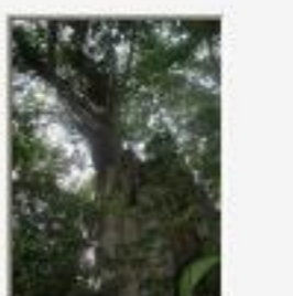
Karst5280086.JPG Karst hill near Midway, Toledo