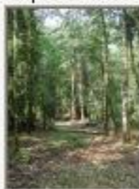
P5040056.JPG Landing trail from Conejo to Temash Lagoon.