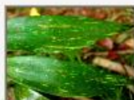
Zam_var_if.jpg Zamia variegata. Conejo Creek, Toledo.