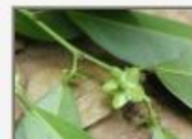
Hei_med5050084.JPG Heisteria media. Olacaceae. Sunday