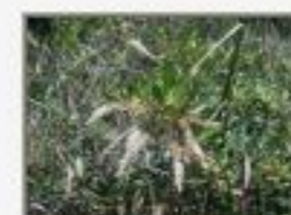
Cyr_rac5220099.JPG Cyrilla racemiflora. Cyrillaceae. Sphagnum