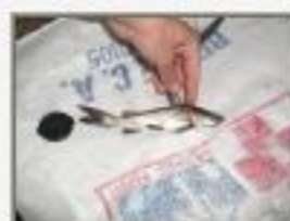
\ri_ass4230002.JPG Ariopsis assimilis?