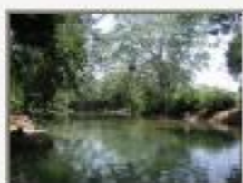
Sarstoon4160003.JPG Temash at Crique Sarco, Toledo District, Belize.