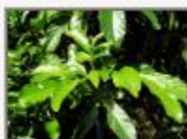
Tri_pal9100046.JPG Trichilia pallida = montana (?), Meliaceae.