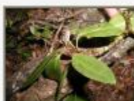
Ant_sca5030024.JPG Anthurium (scandens?). Araceae. Conejo, Toledo