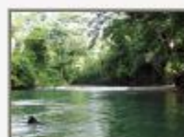
Criq_sar9110044.JPG Crique sarco: road crossing