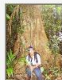
Ste_mex_san.JPG Sterculia mexicana. Sterculiaceae. Bole. With