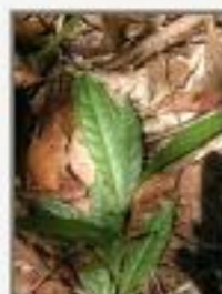
Mac_tin4250019.JPG Maclura tinctoria, Moraceae. Barranco,