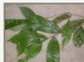
Hir_ame4240017.JPG Hirtella americana. Chrysobalanaceae.