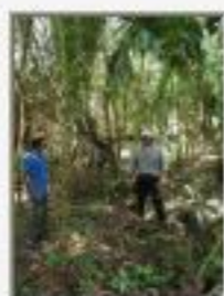
The_cac4160017.JPG Theobroma cacao plantation from Greg