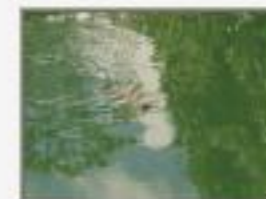
Der_maw9100087.JPG Dermatemys mawii,