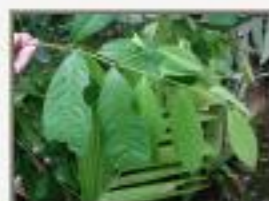
May_sch5200027.JPG Maytenus schippii? Celastraceae?