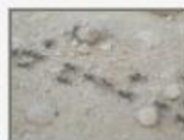
Brach5040067.JPG Brachypelma?? Procession of baby