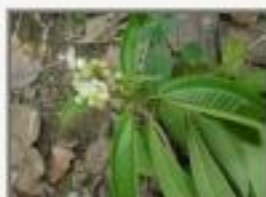
Con_5050097.JPG Conostegia sp.?? Melastomataceae.