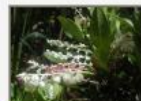
Sch_bel5220094.JPG Schizocardia belizensis. Clethraceae. Sphagnum