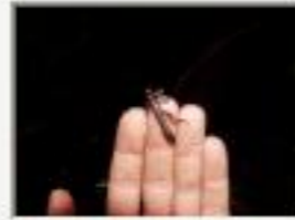
Phas_9090022.JPG Phasimid. Crique Sarco