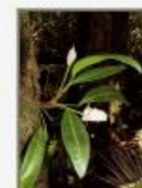
Ant_sca8260094.JPG Anthurium nr. scandens. Crique Sarco, Toledo