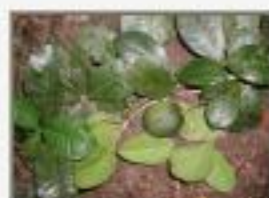
Amp_5030020.JPG Amphitecna, Bignoniaceae. Conejo