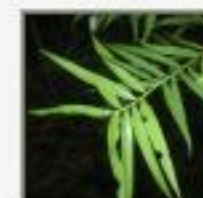
P5210038.JPG Podocarpus guatemalensis.