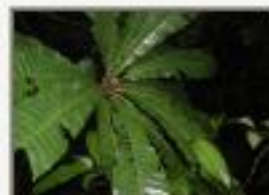
Pou_5280045.JPG Pouteria sp. Sapotaceae. Base of limestone hill,