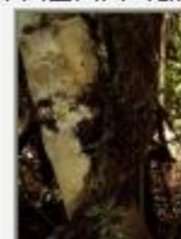
Pleur_8260069.JPG Pleurothallus sp. Orchidaceae, Sarstoon