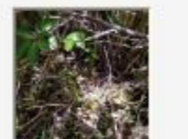
Spha_8260074.JPG Sphagnum bog nr Sarstoon River