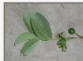
Psi_gua4230007.JPG Psidium guajava. Myrtaceae. Barranco,