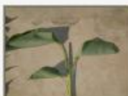
Calathea4230022.JPG Calathea sp. Maranthaceae.