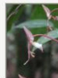
Gon_qui5280064.JPG Gongora quinquenervis. Orchidaeeae. Midway,