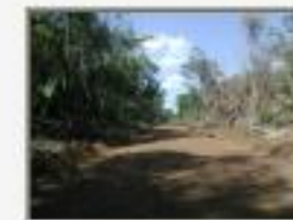
Road5270001.JPG New agricultural road (lease-subdivision) near