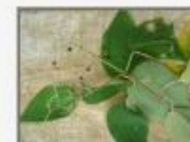
Lea_5050091.JPG Leandra sp.?, Melastomataceae.