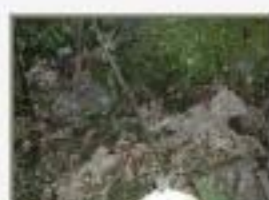
Karst5280084.JPG Karst hill near Midway, Toledo