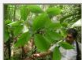
Cou_mac5220083.JPG Couma macrocarpa. Apocynaceae. Temash,