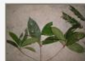
Ama_cor4240016.JPG Amaioua corymbosa. Rubiaceae. Barranco,