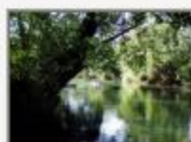
Criq_sar9100059.JPG Temash at Crique Sarco. 682,575