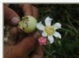
Bel_pen5290110.JPG Bellucia pentamera. Melastomatacae.