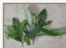
Voc_hon4230008.JPG Vochysia hondurensis. Vochysiaceae.