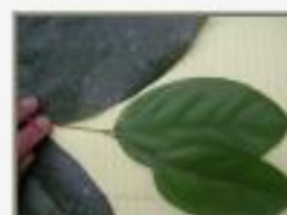
Amp_hot5050079.JPG Ampelocera hottlei. Ulmaceae. Sunday