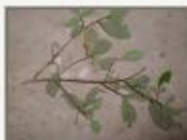
Ery_gua4240022.JPG Erythroxylon guatemalensis.