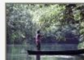
Criq_sar9100070.JPG Collecting of Bribri for fishbait: Temash at 661,647