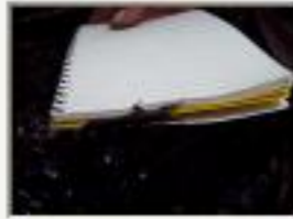
Phas_9090021.JPG Phasimid. Crique Sarco