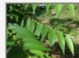
Tre_mic5280057.JPG Trema micrantha. Ulmaceae. Midway,