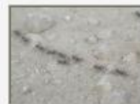
Brach5040069.JPG Brachypelma?? Procession of baby