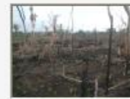
Milpa5280011.JPG New agricultural road (lease-subdivision) near