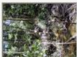
Swampf_CS9090030.JPG Swampforest nr. Crique