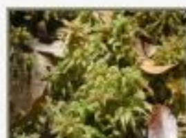
Sph_sub5220093.JPG Sphagnum subsecundum var.