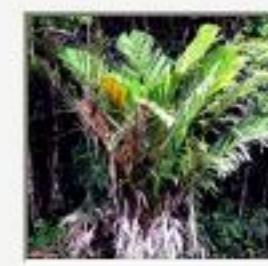
Man_sac_hab.jpg Manicaria saccifera. Sarstoon River.