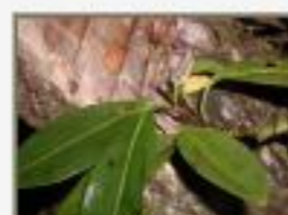
ant_sca5030025.JPG Anthurium (scandens?). Araceae. Conejo, Toledo