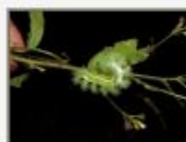
utom_9100041b.JPG Automeris CP on