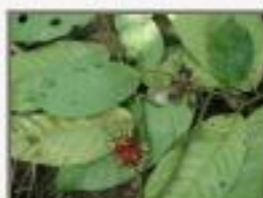
Gua_5050099.JPG Guatteria sp. Annonaceae. Sunday