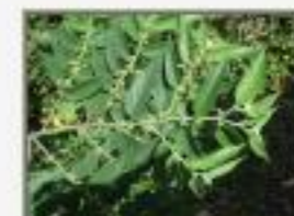
Tre_mic5280058.JPG Trema micrantha. Ulmaceae. Midway,