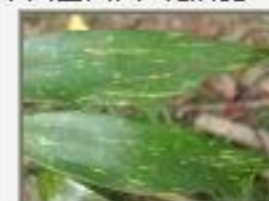
Zam_var5050074.JPG Zamia variegata. Conejo Creek, Toledo.