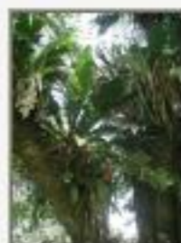
Anth4160011.JPG Anthurium sp. Crique Sarco, Toledo District,