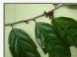
Lac_agr5050081.JPG Lacistema aggregatum, Lacistemataceae.