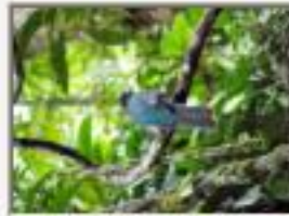
Sla_tro9090018.JPG Slaty tailed trogon,