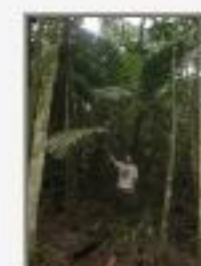
Man_sac5220117.JPG Manicaria saccifera. Arecaceae. Temash