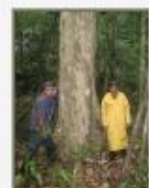
Cra_tap5280038.JPG Crateva tapia?, Capparaceae?. Large