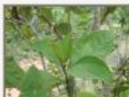
Bel_pen5290111.JPG Bellucia pentamera. Melastomatacae.