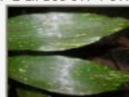
Zam_var5050073.JPG Zamia variegata. Conejo Creek, Toledo.