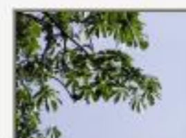
Ste_mex9090007.JPG Sterculia mexicana. Sterculiaceae.