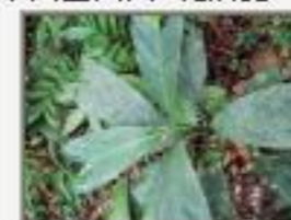
Ast_mar9090025.JPG Asterogyne martiana. Areaceae. Nr Crique