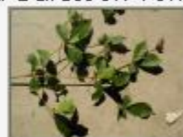
Ter_ama4230012.JPG Terminalia amazonia. Combretaceae.