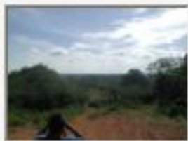
P5280054.JPG View from karst hill in northern Sarstoon