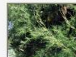
Gua_lon9100050.JPG Guadua longifolia. Poaceae. Crique Sarco