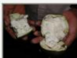
Amp_5030027.JPG Amphitecna, Bignoniaceae. Conejo