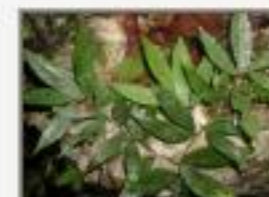
Hym_cou5280033.JPG Hymeneae coubaril. Fabaceae: