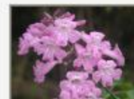
Bign5290113.JPG Bignoniaceae vine. Forest Home, Toledo