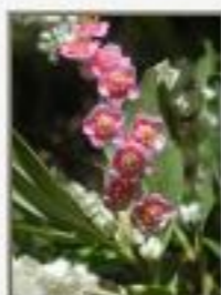
Sch_bel5220097.JPG Schizocardia belizensis. Clethraceae. Sphagnum