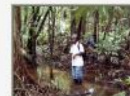
Raymond8260063.JPG Raymon Ramirez in swampforest along