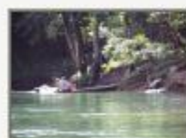
Criq_sar9100062.JPG Temash at Crique Sarco. 605,877