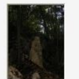
Karst5280082.JPG Karst hill near Midway, Toledo