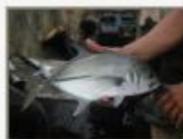
Car_lat5220118.JPG Caranx latus.