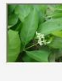
P5050090.JPG Rubiaceae. Sunday Wood, Toledo