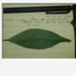
P5040059.JPG To'loch, Watery sap. Conejo Creek, Toledo