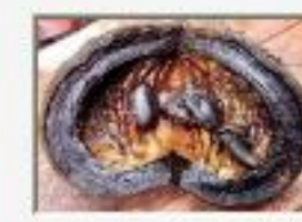
Ste_mex_fr.JPG Sterculia mexicana. Sterculiaceae. Fruit.