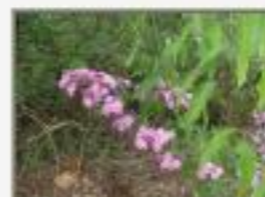
Bign5290112.JPG Bignoniaceae vine. Forest Home, Toledo