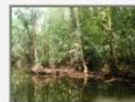
P5030010.JPG Conejo Creek (downstream at