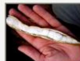
Ing_ver_fr.JPG Inga vera. Mimosoideae. Temash near Crique