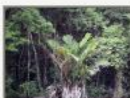
Man_sac8260059.JPG Manicaria saccifera. Sarstoon River.