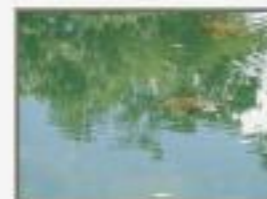
Der_maw9100086.JPG Dermatemys mawii,