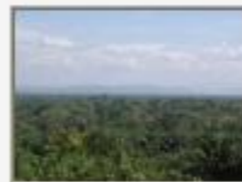
P5280055.JPG View from karst hill in northern Sarstoon