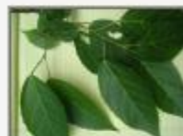
Alc_lat5050082.JPG Alchornea latifolia. Euphorbiaceae. Sunday