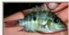
Cic_rob.jpg Cichlasoma robertsoni. Conejo