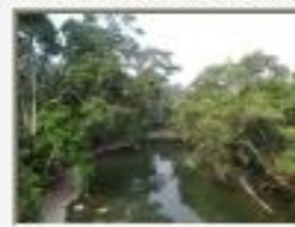
P5060112.JPG Moho River at Santa Anna, Toledo