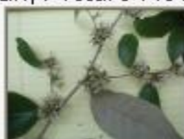
Pip_poe5050078.JPG Piptocarpha poeppigiana, Asteraceae. Sunday