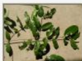
Cal_bra4230009.JPG Callophylum brasiliense. Clusiaceae. Barranco,