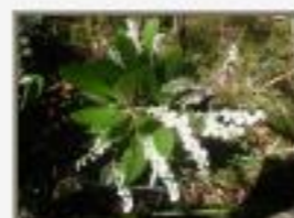
Sch_bel5220098.JPG Schizocardia belizensis. Clethraceae. Sphagnum