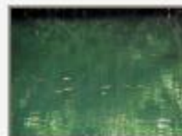
Der_maw9100016.JPG Dermatemys mawii,