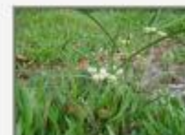
Oxy_cub9100045.JPG Oxycaryum (Scirpus) cubense. Crique Sarco