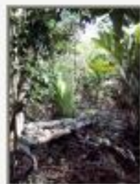
Logging8260018.JPG Logging in manicaria forest along the