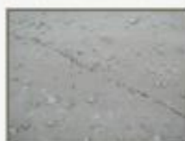
Brach5040066.JPG Brachypelma?? Procession of baby