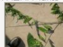
Des_ort4230020.JPG Desmonchus orthocanthos,