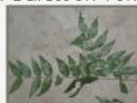
Mou_myrr4240024.JPG Mouriri myrtilloides. Melastomatacea.