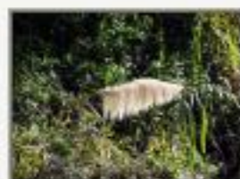
Gyn_sag9100029.JPG Gynesium saggitatum. Poaceae. Temash River