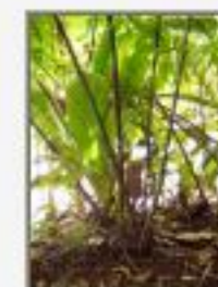
Zam_var8260002.JPG Zamia variegata. Sarstoon River, Belize