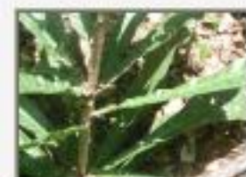
Gri_cau5040052.JPG Grias cauliflora, Lecythidaceae. Conejo