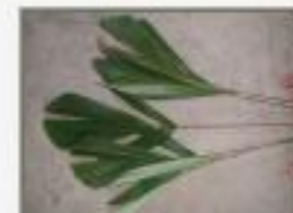
Rei_gra4240012.JPG Reinhardtia gracilis gracilis. Barranco,