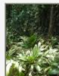
P5040048.JPG Calyptrogyne ghiesbreghtiana,