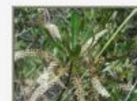
Cyr_rac5220113.JPG Cyrilla racemiflora. Cyrillaceae. Sphagnum