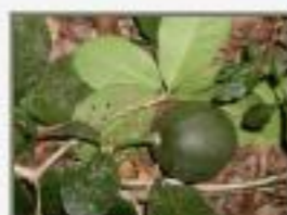
Amp_5030026.JPG Amphitecna, Bignoniaceae. Conejo