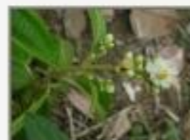
Con_5050098.JPG Conostegia sp.?? Melastomataceae.