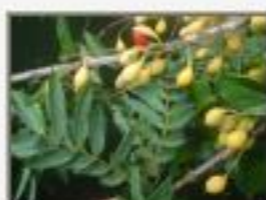
Swa_cub5210056.JPG Swartzia cubensis. Fabaceae: