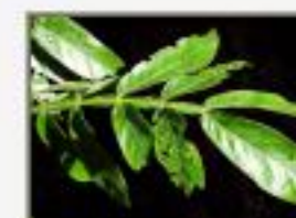
Ing_ver9100055.JPG Inga vera. Mimosoideae. Temash near Crique