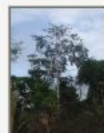
Viola5290100.JPG Viola sp. Myrsinaceae. Midway, Toledo.