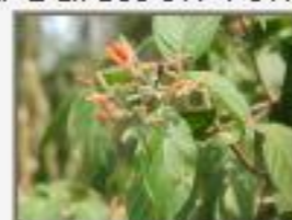
Ham_5050111.JPG Hamelia sp. Rubiaceae. Sunday Wood, Toledo