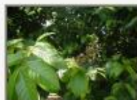
Hir_ame4160006.JPG Hirtella americana. Chrysobalanaceae.