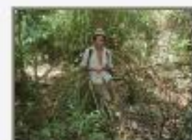
Sym_glo5040050.JPG Symphonia globulifera, Clusiaceae. Conejo