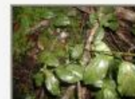
Hyp_5290092.JPG Hyperbaena ? Menispermaceae ?.