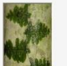
Trichomanes5210046.JPG Trichomanes ??