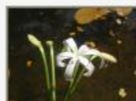
Crinum5040054.JPG Crinum sp. Amaryllidaceae. Conejo