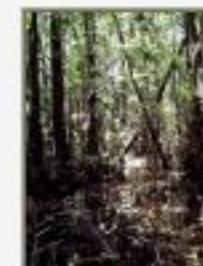
Swamp_sarstoon826006 Swampforest along