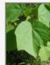
Och_pyr5280056.JPG Ochroma pyramidalis. Bombacaceae.