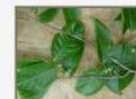
Mar_nob5050093.JPG Margaritaria nobilis, Euphorbiaceae. Sunday