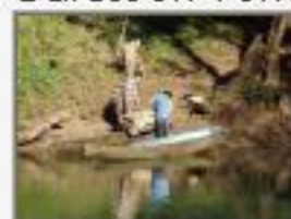
Ciq_sar9100054.JPG Temash at Crique Sarco. 661,647