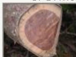
Dal_ste5280019.JPG Dalbergia stevensoni. Papilionoideae. Midway,