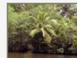
Coc_nuc8260061.JPG Cocos nucifera along Sarstoon River