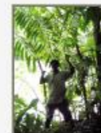
Zam_var8260010.JPG Zamia variegata. Sarstoon River, Belize