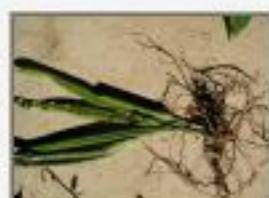
Ant_bak4230015.JPG Anthurium (bakeri?). Araceae. Barranco