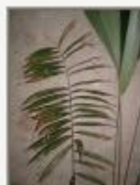
Zam_var4240013.JPG Zamia variegata. Zamiaceae. Barranco,