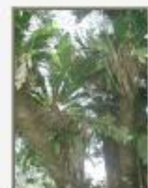
Ant_sch4160012.JPG Anthurium nr. schlechtendalii. Crique