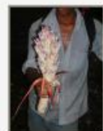
Bro_pin5030029.JPG Bromelia pinguin. Bromeliaceae. Conejo,