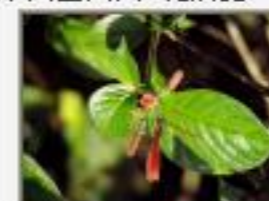
Ham_rov9100042.JPG Hamelia rovirosae. Rubiaceae. Crique Sarco