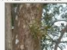
Myr_brys4250007.JPG Myrmecophila brysiana? Orchidaceae. Barranco,