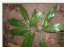
P5280040.JPG Unknown Pouteria like leaf. Bumpy bark. No sap