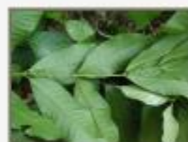
Zan_5050102.JPG Zanthoxylum sp. Rutaceae. Sunday