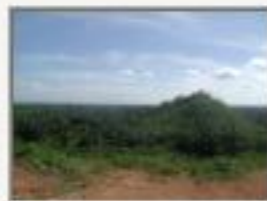
P5280053.JPG View from karst hill in northern Sarstoon