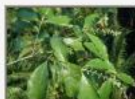
Rin_hum5050071.JPG Rinorea humilis? Violaceae. Conejo Creek,