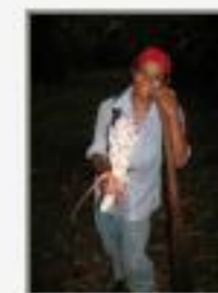
Bro_pin5030028.JPG Bromelia pinguin. Bromeliaceae. Conejo,