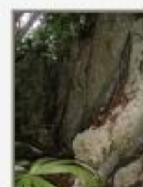
Karst5280083.JPG Karst hill near Midway, Toledo