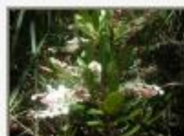
Sch_bel5220095.JPG Schizocardia belizensis. Clethraceae. Sphagnum