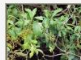
Rubiaceae5280024.JPG Rubiaceae. Midway, Toledo