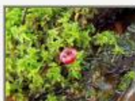
Spha_8260026.JPG Sphagnum bog approach near Sarstoon River.