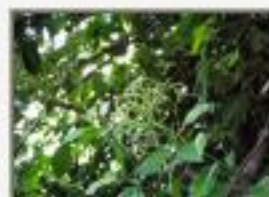
Tour9100091.JPG Tournefortia (bicolor?), Boraginaceae. Temash