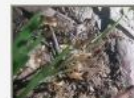
Sch_poe5220069.JPG Schizaea poeppigiana. Schizaeaceae. Sarstoon