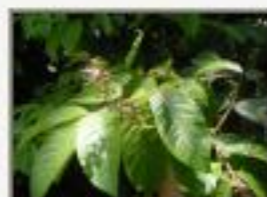
Hir_ame4160007.JPG Hirtella americana. Chrysobalanaceae.