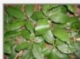
Vit_kuy5030021.JPG Vitex kuylenii, Verbenaceae. Conejo