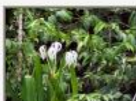
Cri_eru9100098.JPG Crinum erubescens, Amaryllidaceae. Temash