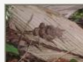
Man_sac5200025.JPG Manicaria saccifera. Arecaceae. Temash