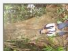
Ste_mex9090006.JPG Sterculia mexicana. Sterculiaceae. Bole. With