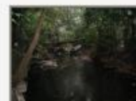
Creek5280031.JPG Creek near karsthill in northern section of