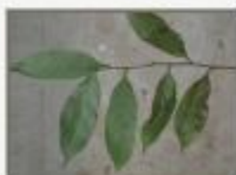
Lac_agg4240027.JPG Lacistema aggregatum. Lacistemataceae.