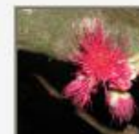
P4250012.JPG Syzygium malaccense. Myrtaceae. Malay Apple.