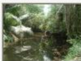
P5030008.JPG Conejo Creek (downstream at