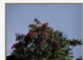
Xyl_fru8260016.JPG Xulopia frutescens. Annonaceae. Sarstoon