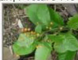
Dav_5050096.JPG Davilla sp. Dilleniaceae. Sunday Wood, Toledo