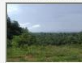
P5280048.JPG View from karst hill in northern Sarstoon