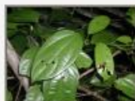
Abu_pan5270004.JPG Abuta panamensis. Menispermaceae.