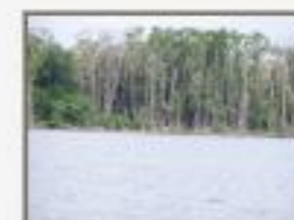
Barr_shore8260048.JPG Mangrove shore south of Barranco