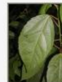
Alc_lat5280015.JPG Alchornea latifolia. Euphorbiaceae. Midway.