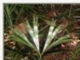
Sch_poe5220071.JPG Schizaea poeppigiana. Schizaeaceae. Sarstoon