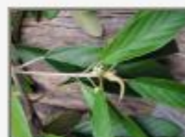
Cou_oli9100076.JPG Coussapoa oligocephala. Cecropiaceae. Temash