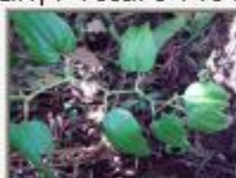
Smi_reg9100007.JPG Smilax regelii, Smilacaceae. Temash