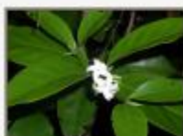
Rubiaceae5280024.JPG Rubiaceae. Midway, Toledo