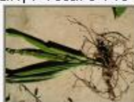
Anth4230015.JPG Anthurium sp. Araceae. Barranco Toledo district