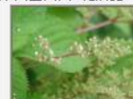
Lap_aes4250016.JPG Laportea aestuans, Urticaceae. Barranco