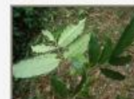
lac_sta5030003.JPG Lacmellea standleyi. Apocynaceae. Conejo