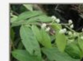
Dic_don5280008.JPG Dichapetalum donnell-smithii var.