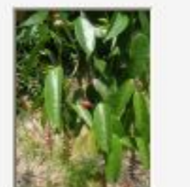
Tro_mex4250018.JPG Trophis mexicana, Moraceae. Barranco,