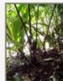
Zam_var8260003.JPG Zamia variegata. Sarstoon River, Belize