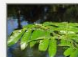
Ing_ver9100053.JPG Inga vera. Mimosoideae. Temash near Crique