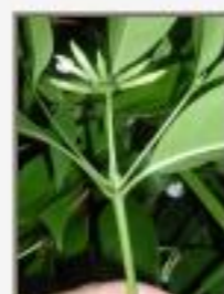
Rubiaceae5280024.JPG Rubiaceae. Midway, Toledo