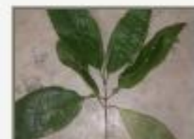
Toc_gui4240018.JPG Tococca guianensis, Melastomataceae.