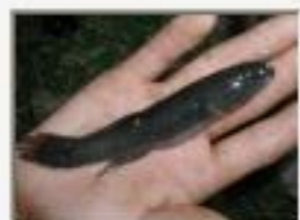
ero_sma5040063.JPG Erotelis smaragdus.