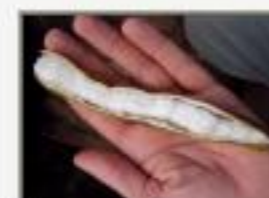
Ing_ver9100027.JPG Inga vera. Mimosoideae. Temash near Crique