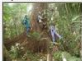
P5040047.JPG Bucida buceras, Combretaceae. Conejo