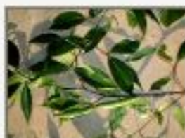
Mal_gua.JPG Malouetia guatemalensis. Apocynaceae. Barranco