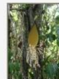
Bac_maj5040055.JPG Bactris major. Areaceae. Conejo