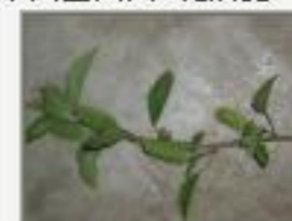
Acal4250017.JPG Acalypha?? Euphorbiaceae?? Herb.