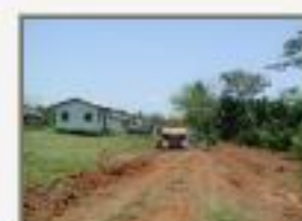
Cric_sar4160010.JPG Crique Sarco, Toledo 440,291