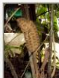
Zam_var8260005.JPG Zamia variegata. Sarstoon River, Belize