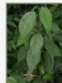
Alc_lat5280014.JPG Alchornea latifolia. Euphorbiaceae. Midway.