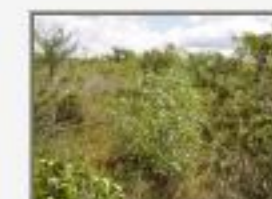
Spha_8260097.JPG Sphagnum bog approach near Black Creek