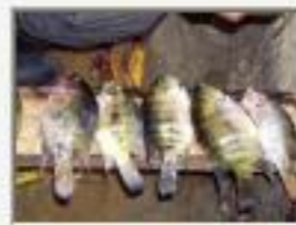
Cic_9100003.JPG Cichlasoma maculicauda (?).