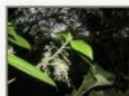
P5280087.JPG Unknown shrub/tree on karst hill. Midway, Toledo