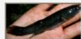
Ero_sma.jpg Erotelis smaragdus. Conejo Creek,