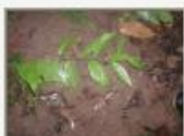
P5280042.JPG "Kunche", Base of limestone hill, Midway,