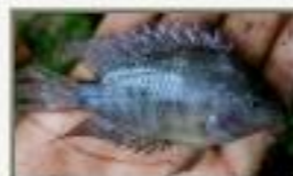
Cic_spi.jpg Cichlasoma spilurum. Conejo