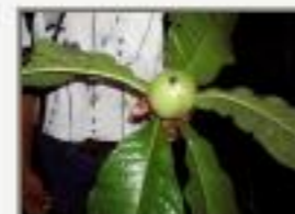
Ran_gen9090036.JPG Randia genipifolia, Rubiaceae. Crique Sarco