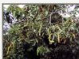
Ing_ver9100022.JPG Inga vera. Mimosoideae. Temash near Crique