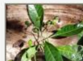
Rubiaceae5280024.JPG Rubiaceae. Midway, Toledo