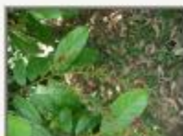
Hir_ame4160008.JPG Hirtella americana. Chrysobalanaceae.