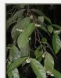
Rin_5280035.JPG Rinorea sp. Violaceae. Midway, Toledo