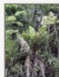
Man_sac8260062.JPG Manicaria saccifera. Sarstoon River.