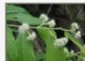
Dic_don5280009.JPG Dichapetalum donnell-smithii var.