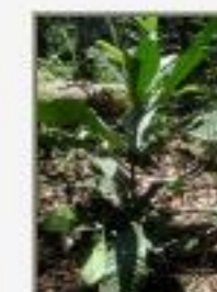
Gri_cau5040051.JPG Grias cauliflora, Lecythidaceae. Conejo