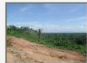
P5280051.JPG View from karst hill in northern Sarstoon