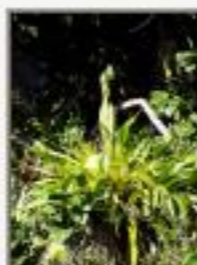
Aec_till9100035.JPG Aechmea tillandsioides. Bromeliaceae. Temash at