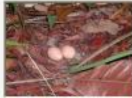
auraque4250011.JPG Pauraque nest with