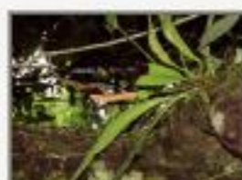
Ant_bak9090024.JPG Anthurium bakeri. Araceae. Crique Sarco