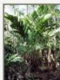
Man_sac8260025.JPG Manicaria saccifera. Sarstoon River.