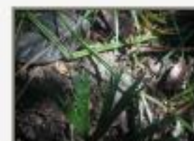
Sch_poe5220070.JPG Schizaea poeppigiana. Schizaeaceae. Sarstoon