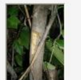
Swe_pan5280022.JPG Sweetenia panamensis. Papilionideae. Midway,