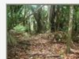
Man_sac5200026.JPG Manicaria saccifera. Arecaceae. Temash