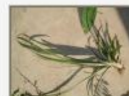
Ana_com4230019.JPG Ananas comosus. Bromeliaceae. Barranco,