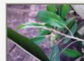
Cou_oli9100077.JPG Coussapoa oligocephala. Cecropiaceae. Temash