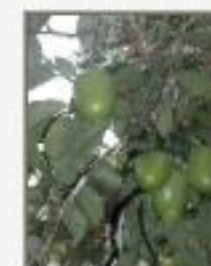
Ano_gla5070019.JPG Anona glabra. Anonaceae. BFREE,