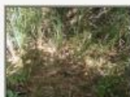
Sph_sub5220110.JPG Sphagnum subsecundum swamp in