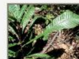
Gri_cau.JPG Grias cauliflora, Lecythidaceae. Conejo