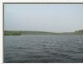
P5030015.JPG Temash lagoon near Conejo Creek, Toledo