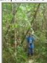
Zam_var5030017.JPG Zamia variegata, Zamiaceae. Temash