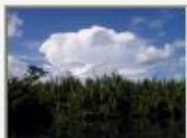
Scrub9100015.JPG Disturbed riparian scrub along Temash near