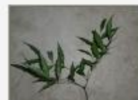
Mat_opo4240025.JPG Matayba opositifolia. Sapindaceae. Barranco,