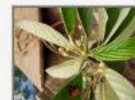
Cou_oli9100079.JPG Coussapoa oligocephala. Cecropiaceae. Temash