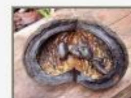
Ste_mex9090013.JPG Sterculia mexicana. Sterculiaceae. Fruit.