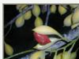
Swa_cub5210055.JPG Swartzia cubensis. Fabaceae: