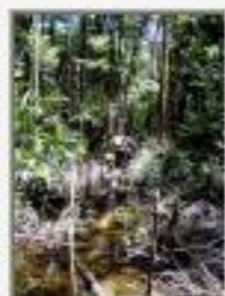
Swampf_CS9090030b.JPG Swampforest nr. Crique