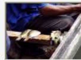
Cic_9100001.JPG Cichlasoma catches. Cichlidae.