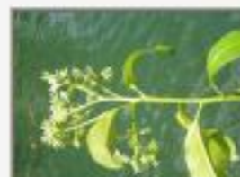
Tour_9100094.JPG Tournefortia (bicolor?), Boraginaceae. Temash