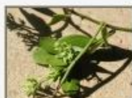
Strut4230014.JPG Struthanthus sp. Loranthaceae. Barranco,