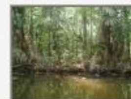
P5030011.JPG Conejo Creek (downstream at