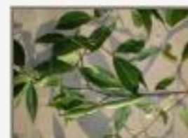
Mal_gua4230028.JPG Malouetia guatemalensis. Apocynaceae. Barranco