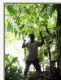
Zam_var8260008.JPG Zamia variegata. Sarstoon River, Belize