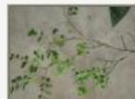
Eugen4240021.JPG Eugenia, Myrtaceae. Barranco, Toledo