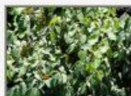
Tri_mar9100097.JPG Trichilia martiana (?), Meliaceae. Temash River