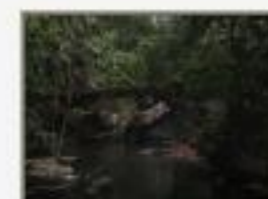
Creek5280032.JPG Creek near karsthill in northern section of