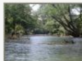
Temash4160013.JPG Temash at Crique Sarco, Toledo District, Belize.