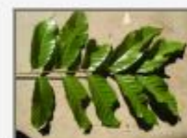
Cupania4230013.JPG Cupania?? Sapindaceae. Barranco Toledo