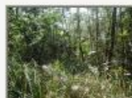
P5220107.JPG Sphagnum swamp in Sarstoon Temash NP