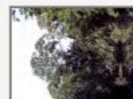
Ced_odo9100067.JPG Cedrela odorata, Meliaceae. Temash River