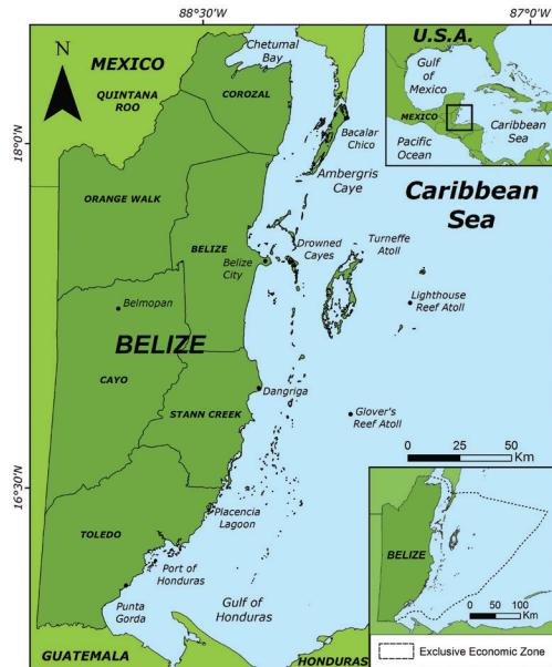
Figure 1. Map of the study region in Belize showing its districts, relevant locations, and the boundary of Belize's Exclusive Economic Zone

we conducted online searches, contacted NGOs and governmental organizations throughout Belize to acquire sighting and stranding records, and collected personal observations with accompanying data that were examined by the authors of this review before verifying species identifications. Reports from local news were only accepted if accompanied by images that could be used for verification. To find articles reporting occurrences of aquatic mammals in Belize, we examined a variety of scientific databases (e.g., Elsevier, Springerlink, Web of Science) and consulted various scientific collections and museums (e.g., Smithsonian Institution National Museum of Natural History) using numerous relevant key words and the scientific and common names of 33 aquatic mammal species previously reported in the Caribbean (e.g., Jefferson & Lynn, 1994; Ward et al., 2001; Platt & Rainwater, 2011).